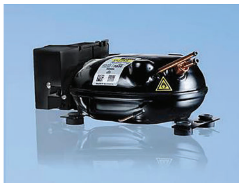
Variable speed compressor with Advanced Energy Optimisation