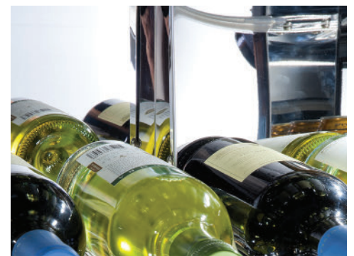
Interior finished in food safe 304 grade polished stainless steel