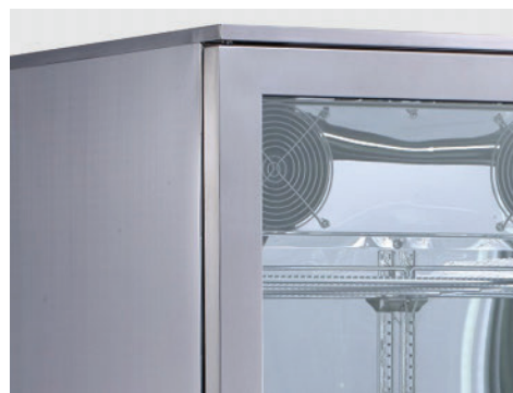
Exterior finished in Marine Grade (316) brushed stainless steel