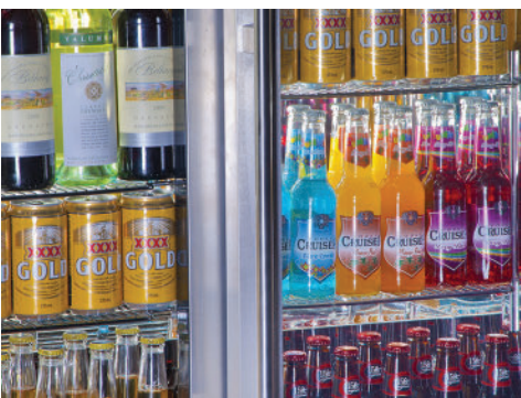
Cools up to 5 times faster than an ordinary household chiller