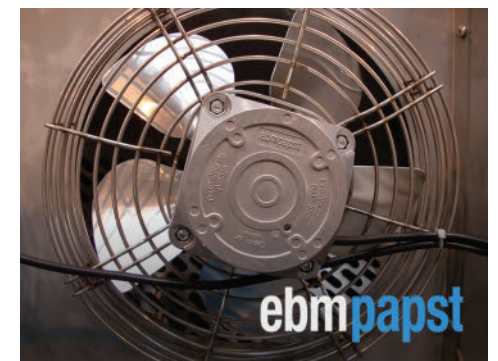
Whisper quiet, energy saving fans from German brand leader EBM Papst