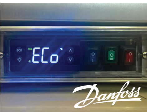
Precision electronic temperature control with Eco mode function