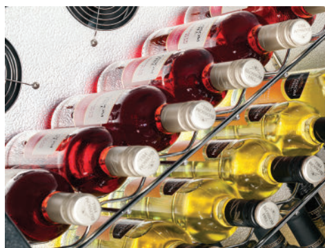
Height adjustable shelves with split level display possibilities on XP2 & 3