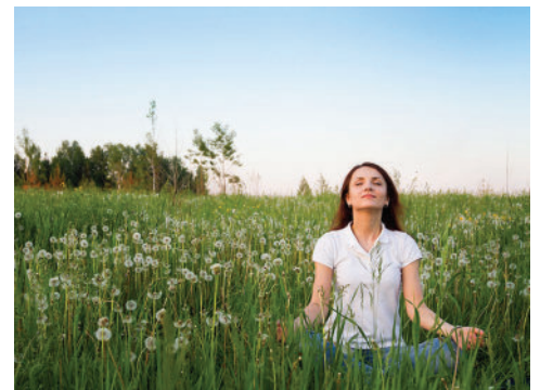
Natural refrigerant gas is Greenpeace approved Zero ODP with negligible GWP