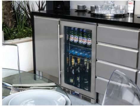
Heated glass doors to eliminate condensation on humid days