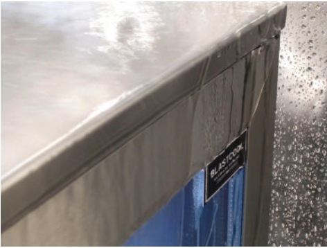
Safety approved for outdoor use. Officially IP Rated and Certified.