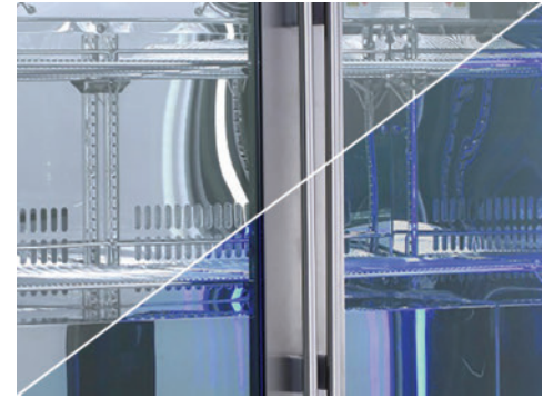
User selectable white or blue all-round LED illumination for the ideal ambience